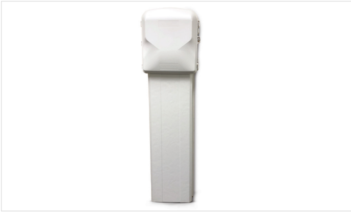
OptiSheath MDU Terminal Indoor/Outdoor Skirt