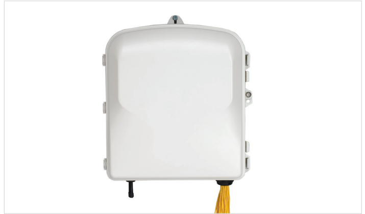
OptiSheath MDU terminal (closed)

The OptiSheath® MDU terminal is a rugged, indoor/outdoor low-profile interconnect between the distribution network and indoor/outdoor drop cables for multidwelling unit applications. Compatible with loose tube and ribbon cables, the terminal can also accommodate Corning® ClearCurve® rugged drop cable.