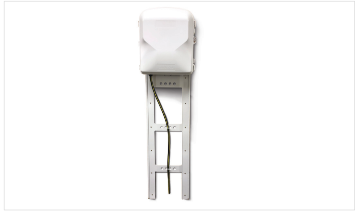
OptiSheath MDU Terminal Mounting Bracket

The indoor/outdoor protective skirt kit allows the removal and installation of the skirt without tools after initial installation. The cavity created by the skirt and mounting bracket features allow both cable management and storage for the incoming and drop cables.