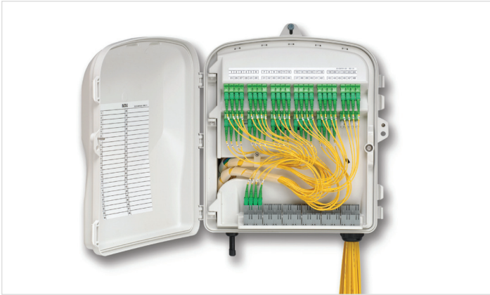
OptiSheath MDU terminal (open)