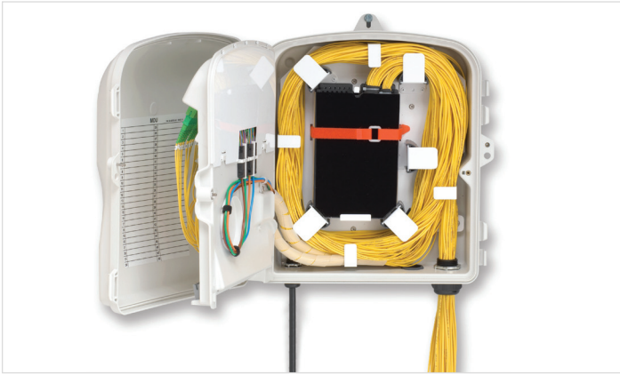
OptiSheath MDU Terminal Splice Compartment