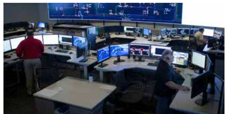
Shown here is the command center for EPB's advanced smart grid power management system.

Today, EPB distributes electricity over its advanced smart grid power management system to nearly 180,000 homes and businesses in an area that includes greater Chattanooga, as well as parts of surrounding counties and areas of North Georgia. Every home and business also has access to EPB's