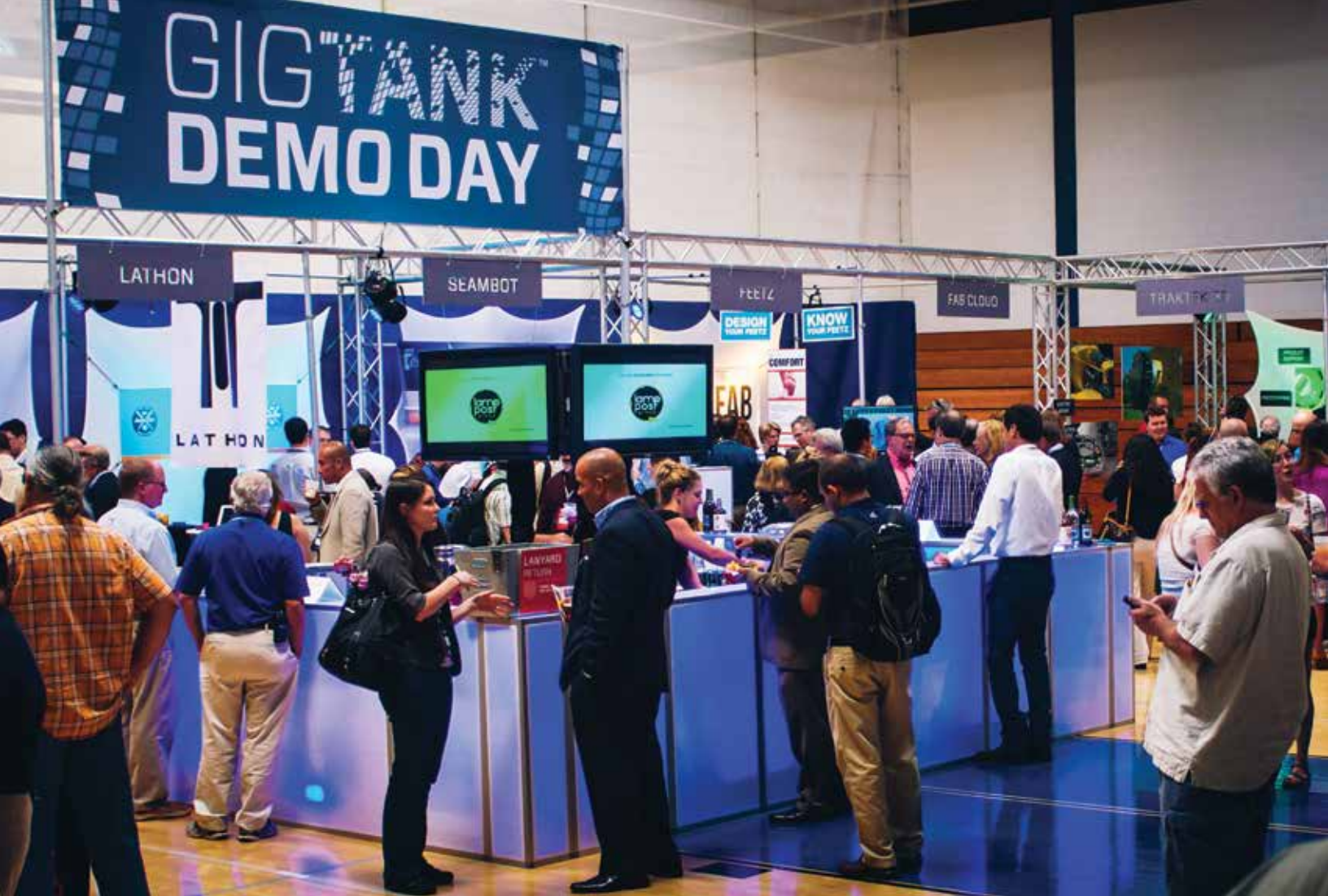
Co.Lab's GigTank program attracts startups to build next-gen businesses and applications over Chattanooga's advanced internet grid.

lightning-fast 10 Gig/10,000 Mbps services over its all-fiber communications backbone, and the community is buying into the connected experiences that EPB enables; as of March 2019, more than 100,000 homes and businesses subscribe to one or more of the triple-play services offered by EPB Fiber Optics. About 58 percent of the marketable homes and businesses in EPB's service area subscribe to one or more fiber optic services, an impressive take rate especially in an area where well-established, national service providers also compete.