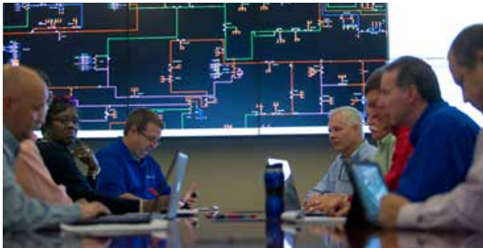
EPB's smart grid delivers real-time data for storm management.

Ultimately, EPB envisioned Chattanooga's smart grid as a next-generation electric system that would use smart devices across the network to communicate with each other and human operators to reduce the duration of power outages, improve response time, and allow customers greater control of their electric power usage.