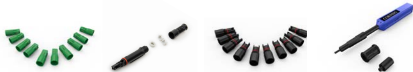
Evolv SC Converter with Pushlok Technology

Field-installable SCA and OptiTap® converters provide simple compatibility with existing infrastructure. Port cleaners offer full cleaning of the connector end face for both Pushlok and OptiTap connectors. Terminal covers can be painted to make terminals virtually disappear on building façades. Bracketry options support easy, go-anywhere installation.