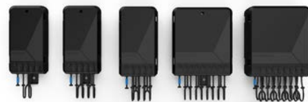
2-, 4-, 8-, and 16-Port Splitter Terminals