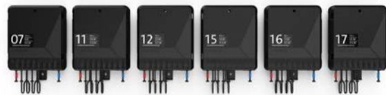
2-, 4-, and 8-Port Optical Tap Terminals (4-Port Optical Tap Terminal Family Shown)