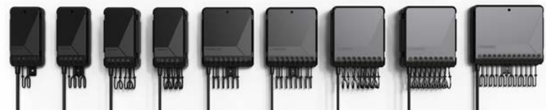
2-, 4-, 6-, 8-, 12-, and 16-Port Stubbed Terminals

A quarter of the size of conventional preconn products, Evolv terminals are designed to go anywhere — on poles, façades, strands, in pedestals and handholes. Maximize the flexibility and minimize the stress of your FTTx deployment.