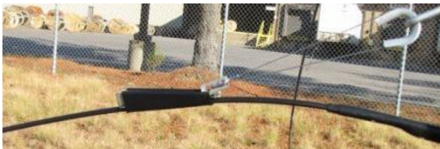
Figure 3. RPX Deadend Clamp (RPX-DEADEND-E1)

The RPX Deadend clamp is a mechanical wedge style clamp. This stainless steel clamp is designed to hold the required cable load without damaging the cable. The bail is removable for ease of installation with standard pole hardware and is designed with a breakaway feature at approximately 1000 lbs. when used around a ½” diameter eyebolt.