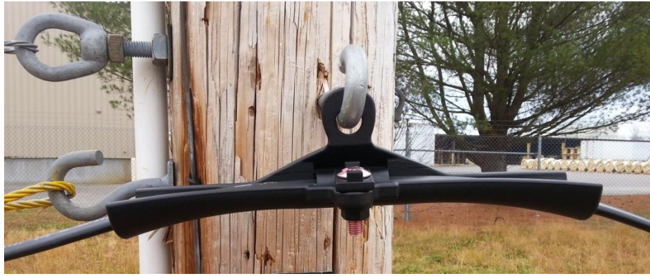
Figure 4. RPX Suspension Clamp (RPX-SUSP-H1)

Corning does not recommend the use of midspan drop attachments to ADSS cables because of the extra loading incurred when used in a self-support method. Depending on the environmental conditions, the rated loading of the cable could be exceeded. ADSS cables can move more than steel messengers when environmentally loaded. This movement will, in turn, change the sag of the drops going to the home. In conditions such as heavy ice loading and/or high wind, the drop cables could sag close the ground, risking damage. If midspan drop attachment is required, contact Corning Technical Support for assistance.