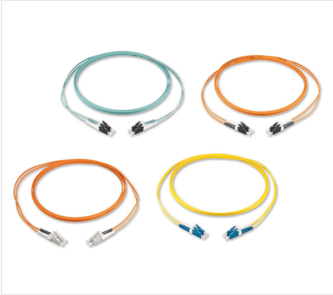
LC Duplex to LC Duplex Patch Cords | Photo CRR3409