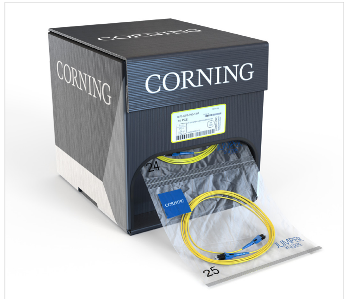
Jumper in a Box | Photo REN9458

Jumper in a box is an innovative packaging solution designed to fulfill your needs of organization, convenience, and efficiency. It includes a self-tracking inventory system and bold, color-coded part identification at a glance. Jumpers are available in a wide range of configurations (see below for full details).