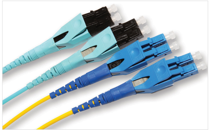
Reverse Polarity Uniboot Duplex Patch Cords | Photo LAN2223

Reverse Polarity Uniboot Duplex patch cords allow for the quick and easy conversion from a TIA-568 A-B polarity to a TIA-568 A-A polarity without exposing the fibers or needing any tools. This patch cord comes with a straight-through polarity from the factory, but you can convert it to a flipped patch cord with no tools. This uniboot design allows one cable to carry both fibers, reducing patch cord bulk when routing.