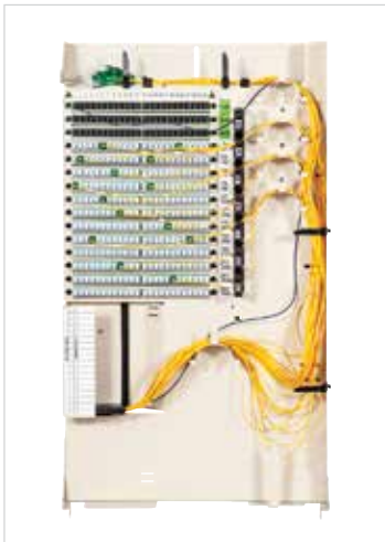
Fiber Frame SS 288/72