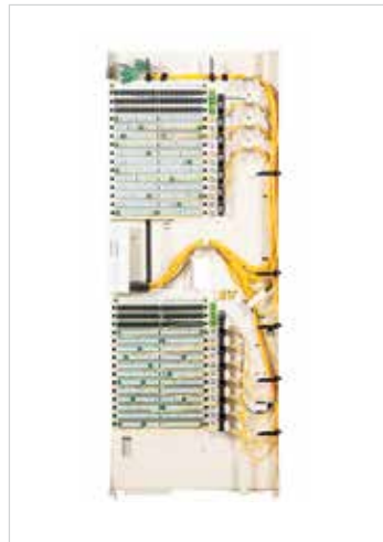
Fiber Frame SSK 576/144