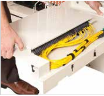
Fiber Frame Installation Step