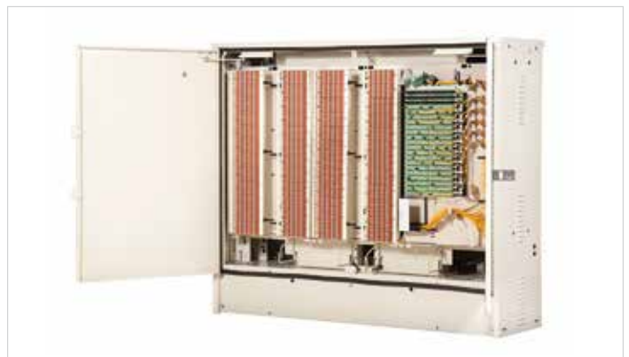
Example of a Fiber Frame in a Copper Cabinet

Fiber frames are designed to be modular, enabling them to work with most cabinets currently deployed in networks today. These frames will mount directly into the cabinets when used in conjunction with an optional hardware mounting kit or newly installed bottom frame support. The frames can be mounted in the same location and space that is available within an existing cabinet that could also mount the standard copper frame if required.