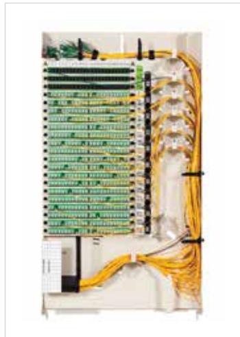
Fiber Frame SS 432/72