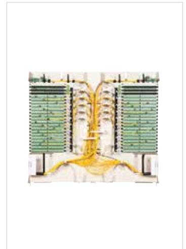
Fiber Frame SSD 864/144